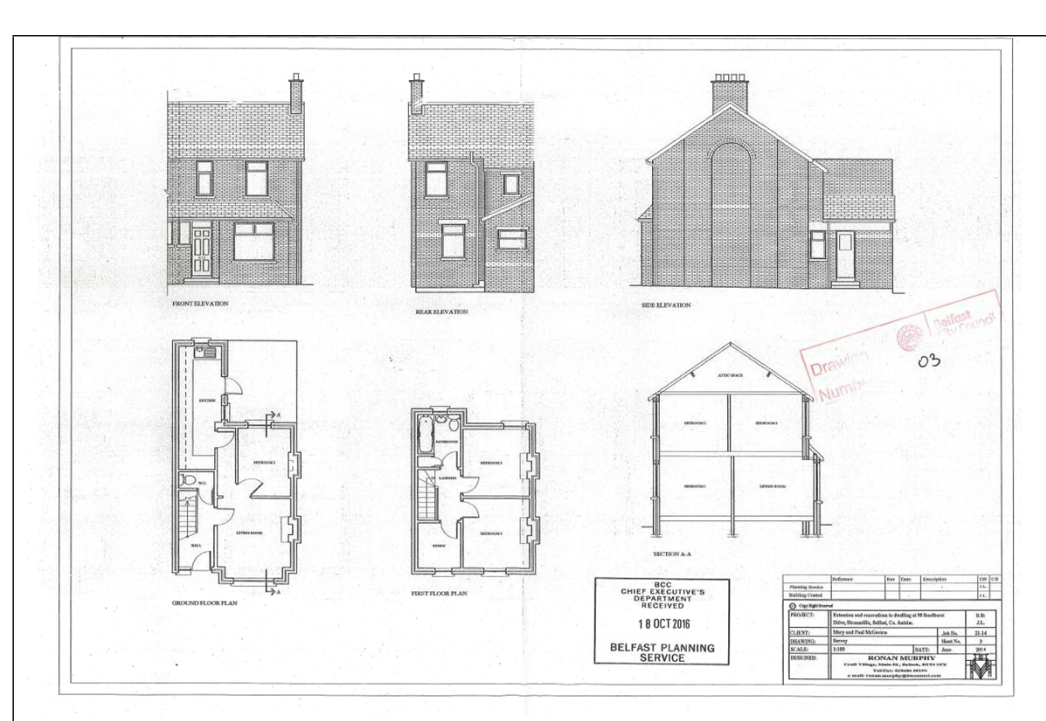
Existing Elevations / Floor Plans