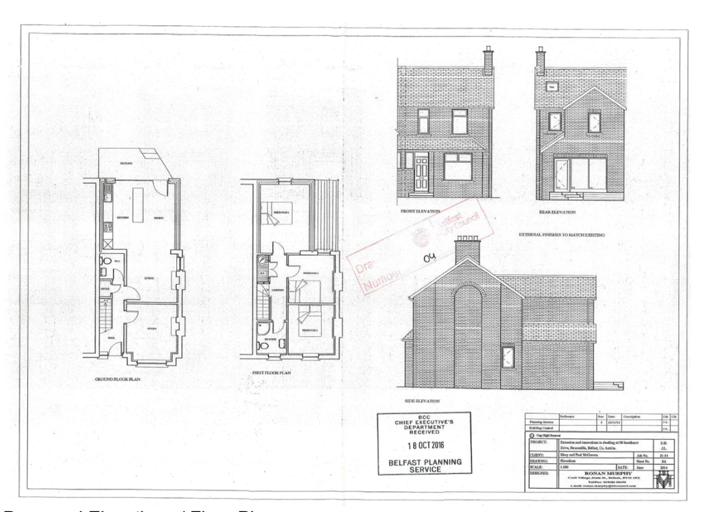
Proposed Elevations / Floor Plans